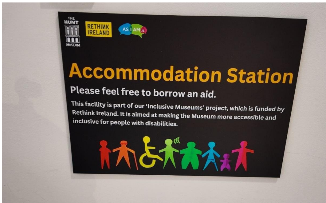
The sign for our Accommodation Station.

We are working to increase the range of aids offered through the Accommodation Station. Soon a sensory map of the Museum will also be available through it.