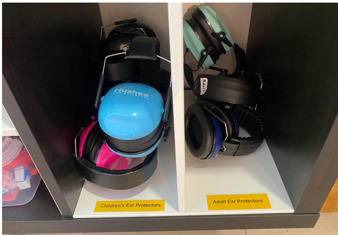
A photo of the ear defenders that can be borrowed.