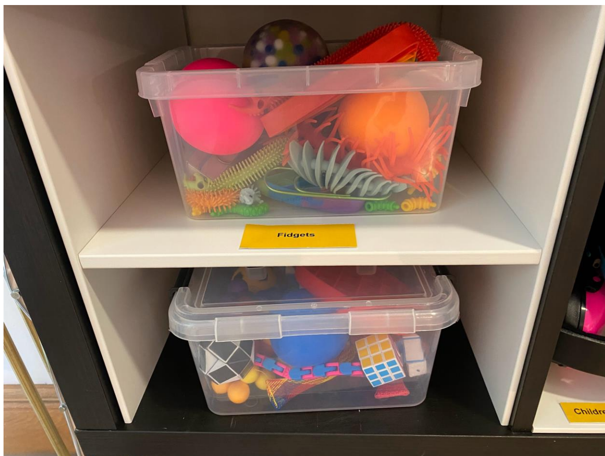
A photo of some of the sensory fidgets that can be borrowed.