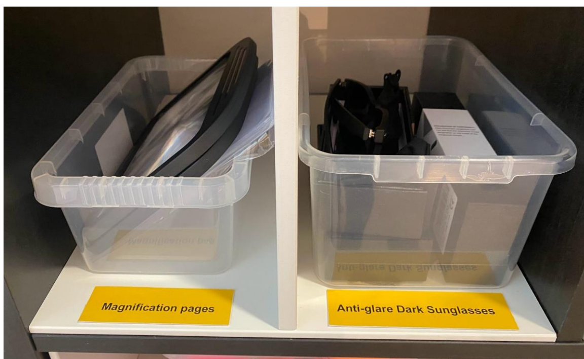
A photo of aids for people who are visually impaired. These include magnification pages and anti-glare dark sunglasses for people who are light sensitive.